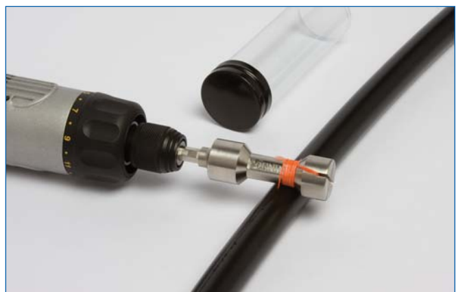
RPOC-001 Ripcord Puller for Outdoor Cable Tool (Cordless Screwdriver Not Included) | Photo LAN1347