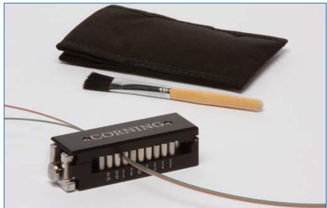
RST-000 Ribbon Splitting Tool | Photo LAN1348