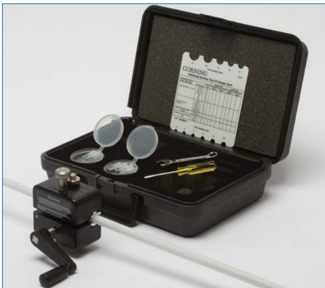
Universal Access Tool (UAT3) | Photo LAN1356

The Universal Access Tool (UAT3) simplifies a midspan access on any Corning Cable Systems single-tube fiber optic cable product, including ribbon cable. Unlike other access tools requiring strength and awkward handling, the UAT3's design allows controlled movement. Its unique drive mechanism easily pulls the tool along the tube as the T-handle is turned. As the tool passes down a length of tube, two blades on opposite sides of the tool score the outside of the tube. These precise cuts on the outside of the tube may then be split to expose the bundled or ribbon fibers inside.