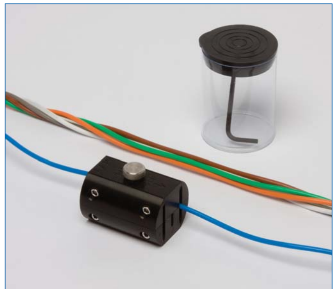
OFT-000 Optical Fiber Access Tool (OFAT) | Photo LAN1346

The Optical Fiber Access Tool (OFAT) is designed to provide midspan fiber access in standard Corning Cable Systems ALTOS® Cables. This rugged hand tool will accommodate buffer tubes from 2.4 to 3.0 mm. The OFAT clamps over a buffer tube. As the tool is pulled along the buffer tube, two offset blades split the tube without damaging fibers inside.