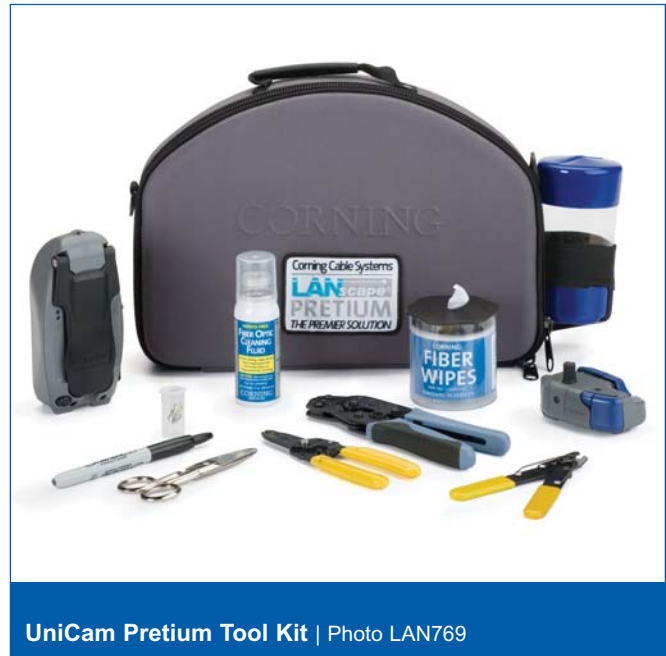
UniCam Pretium Tool Kit | Photo LAN769

installation tool and the high performance cleaver virtually eliminate human variability from the installation to allow superior optical performance for the most demanding single-mode applications. Thoughtfully designed with the needs of network installers in mind, the UniCam® Pretium™ Tool Kit can quickly install a UniCam Pretium-Performance Connector in about 45 seconds. From the cleaver, with its integrated fiber scrap bin and dual-clamp precision hold, to the installation tool, with its immediate go/no-go feedback signal, installation is as easy as strip, clean, cleave, cam and crimp – with exceptional optical performance guaranteed. Factory tested, typical insertion loss is 0.4 dB with a maximum insertion loss of 0.75 dB. By allowing fast termination and high installation yields with no consumables, lower installation costs are realized. With reliable, proven technology and more than 44 million sold, every UniCam Connector is 100 percent guaranteed to meet the published specification at the time of installation, or Corning Cable Systems will replace it. Offered in single packs and the new UniCam Connector organizer packs, direct 250 µm termination SC connectors are also available.