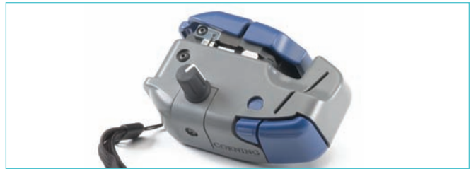
Pretium Cleaver | Photo LAN805