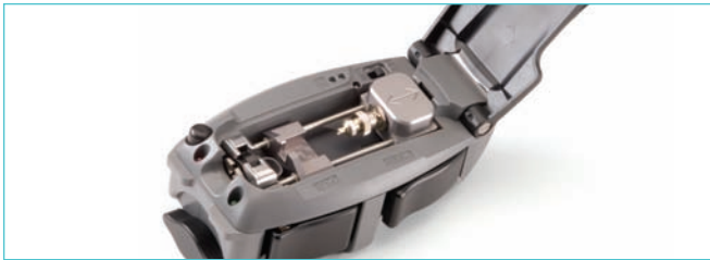
UniCam® Pretium™ Installation Tool | Photo LAN770