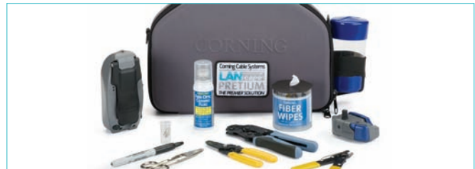
UniCam Pretium Tool Kit