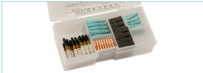
UniCam Connector Organizer Pack (multimode SC connectors shown) | Photo LAN809